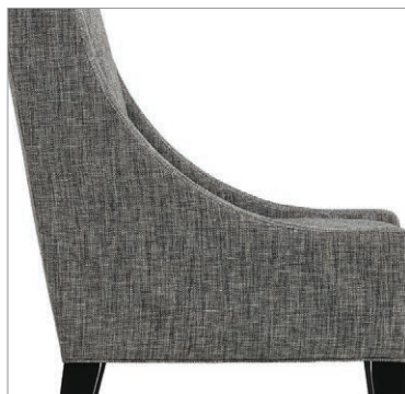
Classic swoop arm design