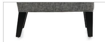
9" tapered solid wood leg