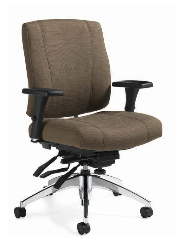
3651-3 Medium Back Multi-tilter shown in Momentum, Vario, Linen (VA41).