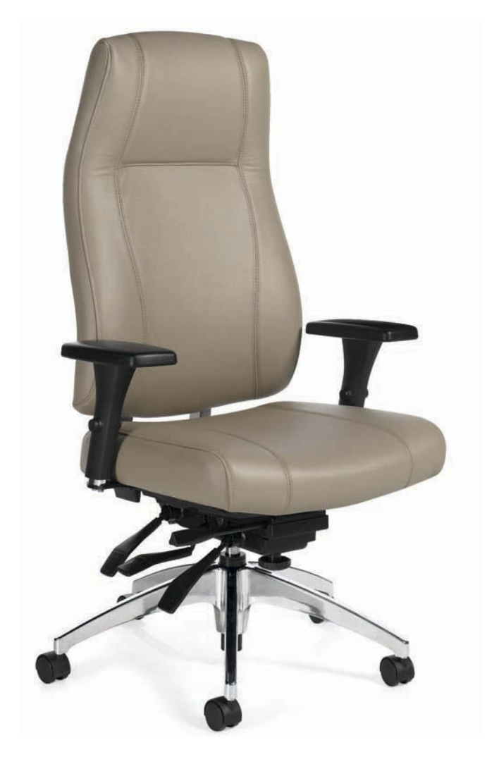
3650-3 High Back Multi-tilter shown in Spinneybeck, Leather, Oatmeal (VL73).

Triumph is an executive multi-tilter series that offers exceptional ergonomic support with a range of adjustability to create a near-custom fit. The multi-tilt mechanism allows seat and back position to be configured independently of each other to suit individual preferences for comfort and working position.