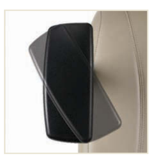
Armcap angles inward 30° aiming toward the center of the keyboard.