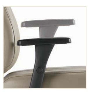
Arm moves up and down for effective arm support