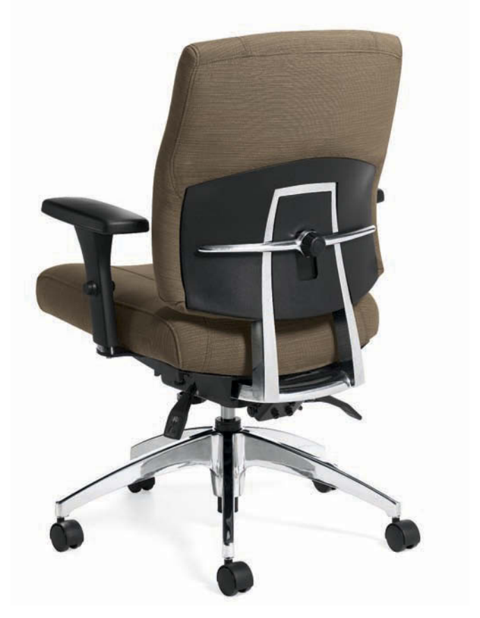
3651-3 Medium Back Multi-tilter - Back View