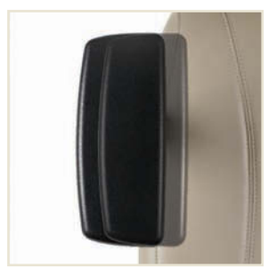
Armcap slides over top of the seat to narrow the space between the arms.