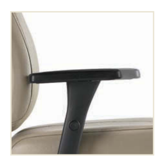
Armcap slides forward or backward to position for body size.