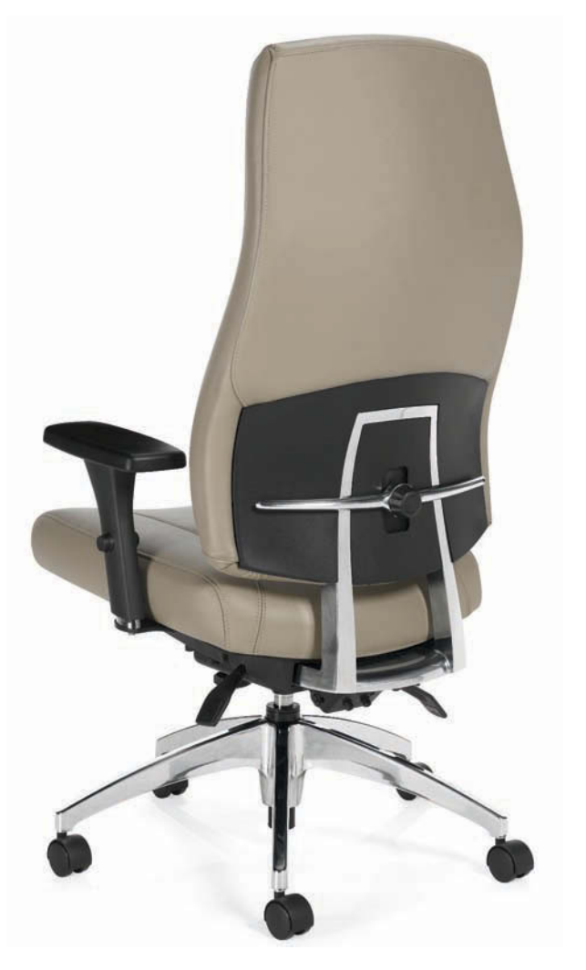
3650-3 High Back Multi-tilter - Back View

Triumph is an executive multi-tilter series that offers exceptional ergonomic support with a range of adjustability to create a near-custom fit. The multi-tilt mechanism allows seat and back position to be configured independently of each other to suit individual preferences for comfort and working position.