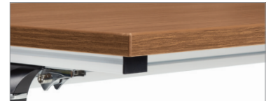
Table tops available in a large variety of laminate finishes (Walnut Heights shown)