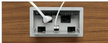
Optional power block includes power and data