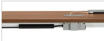
Optional wire management snap-in channel