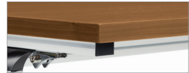
Table tops available in a large variety of veneer finishes (Latte Walnut shown)