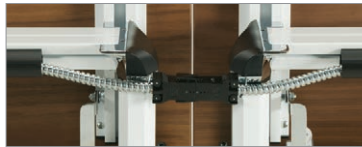
Optional daisy chain power management