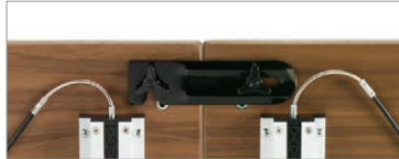
Optional ganging plates