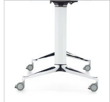
Vertical upright available in Black, Tungsten, Nevada, Taupe, Silver and Storm Grey (Designer White shown)