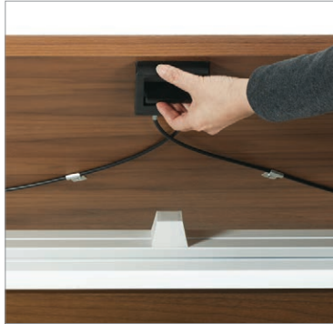
One handed flip up operation