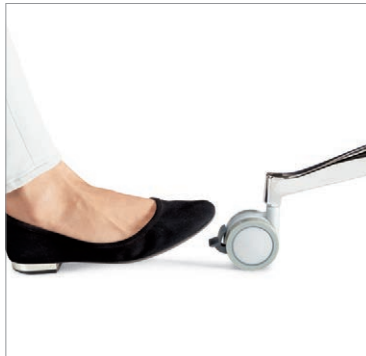
Locking dual wheel casters swivel 360°