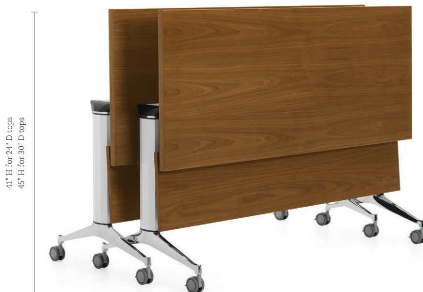
Optional modesty panel articulates with table top in upright position.