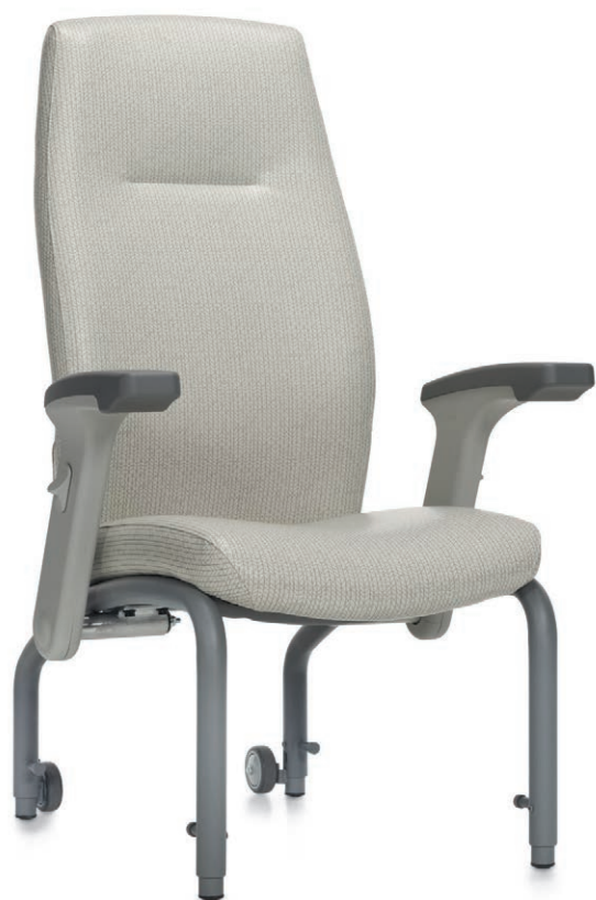
High back patient chair with Schukra lumbar and headrest