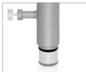
3" height adjustable legs with preset locking pin