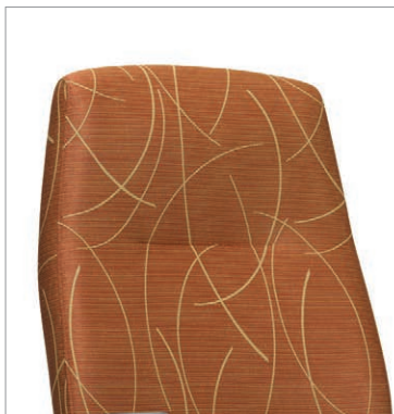
Concealed Schukra adjustable headrest support for easy adjustment and individual comfort (on select models)