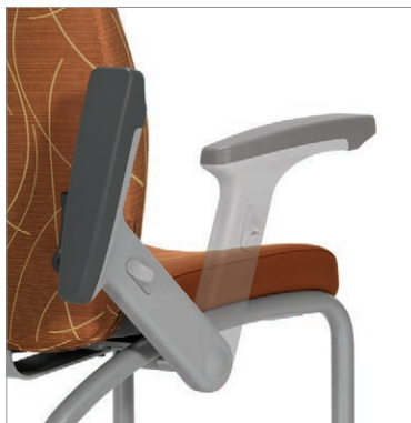
Patient transfer arms fold out of the way when the trigger is released and allow horizontal movement in and out of the chair