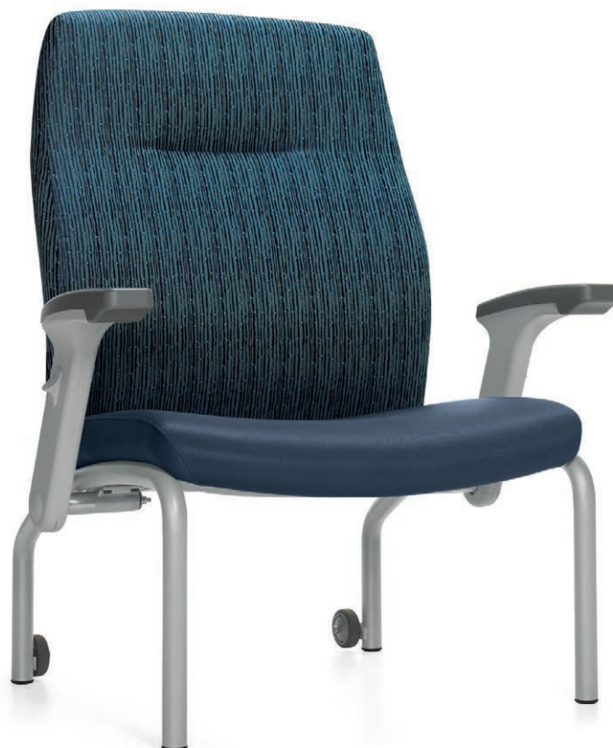
Bariatric high back patient chair

Nourish™ was developed in consultation with leading healthcare professionals. It is an innovative, state-of-the-art patient chair that offers unique features to accommodate a variety of body types, sizes and mobility issues. To facilitate safe patient transfer, each arm can easily be raised allowing horizontal movement in and out of the chair.