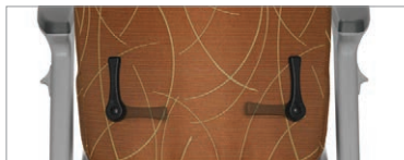
Concealed Schukra adjustable lumbar support (on select models)