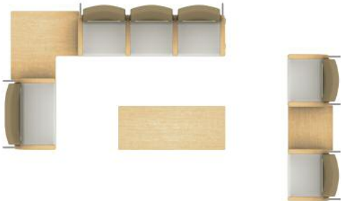
Layout E 1x GC4235R, 1x GC4241L, 1x GC4231L, 1x GC4231R, 1x GC4277-HP, 1x GC4283-HP, 1x CG4275-HP