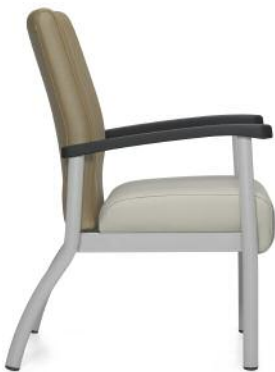
Low Back Armchair, frame shown in Tungsten (TUN). Urethane armcaps shown in Black (BLK)