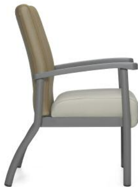
Low Back Armchair, frame and urethane armcaps shown in Platinum (PLT)