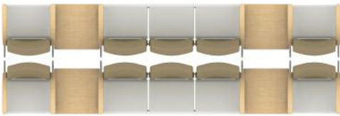
Layout H 2x GC4233B, 2x GC4231L, 2x GC4231R, 4x GC4275-HP