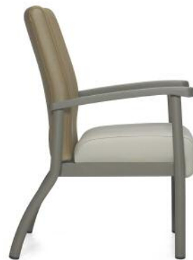
Low Back Armchair, frame and urethane armcaps shown in Toast (TOA)