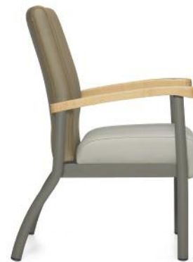
Low Back Armchair, frame shown in Toast (TOA), hardwood armcaps in Maple (AVM)