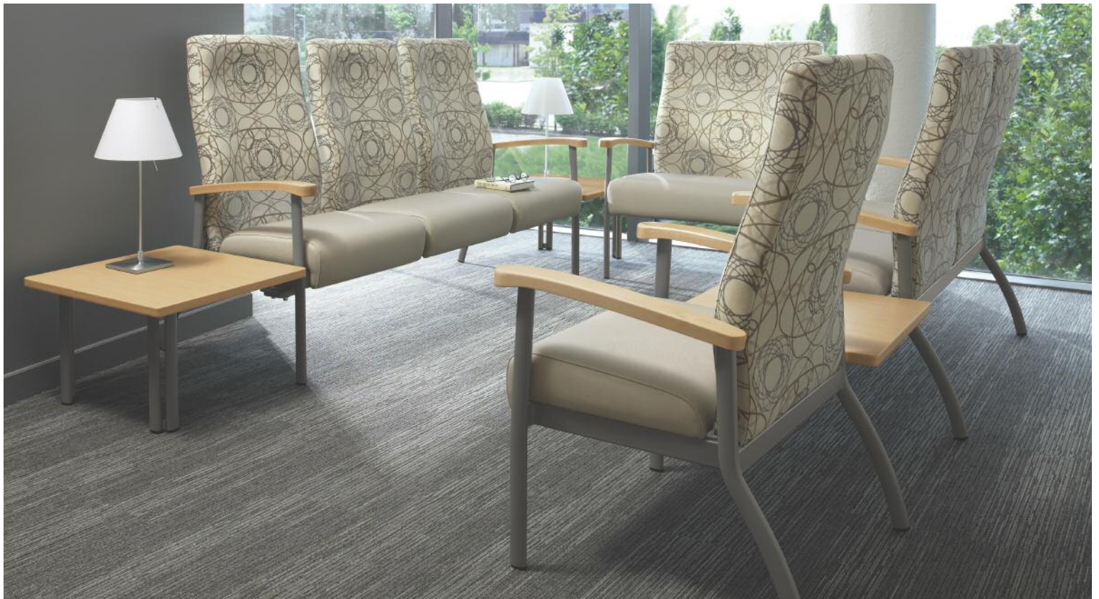
Above top: Fabrics in Momentum, Spin, Carte Blanche (09123937), Momentum, Max, Ouzo (09092488). Frames and armcaps in Toast (TOA). Laminates in Tiger Maple (W820). Above bottom: Momentum, Spin, Carte Blanche (09123937), Momentum, Max, Coquito (09092400). Frames in Toast (TOA). Armcaps in Maple (AVM). Laminates in Tiger Maple (W820). Cover and back: Fabrics in Momentum, Spin, Carte Blanche (09123937), Momentum, Max, Malt (09092444). Frames and armcaps in Toast (TOA). Laminates in Tiger Walnut (W819).