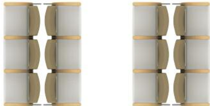
Layout A 4x GC4235