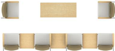
Layout F 2x GC4231, 1x GC4236L, 1x GC4236R, 1x GC4283-HP, 1x GC4275-HP