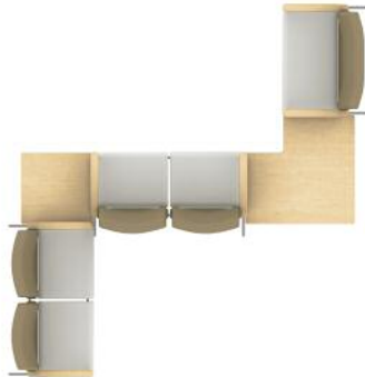
Layout G 1x GC4232, 1x GC4232R, 1x GC4241L, 1x GC4277-HP, 1x GC4282-HP