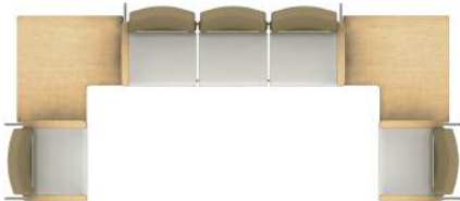
Layout C 1x GC4233B, 1x GC4231L, 1x GC4231R, 2x GC4277-HP