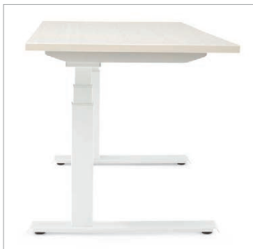
C-foot (recommended for 90° configurations)