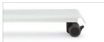
Dual wheel casters