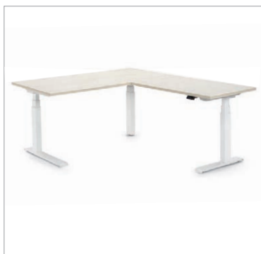
Add a return and third leg kit to create an L workstation.