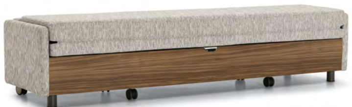
Dreme sleeper bench, low profile design, positions well below room windows to welcome natural light. Optional laminate, pull-out front panel shown.