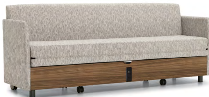
Dreme sleeper sofa with upholstered back and arms. Optional laminate, pull-out front panel shown. Optional power and USB outlet shown.

Seating shown in CF Stinson Enhance, Oxygen with Walnut Heights panel and Toast legs.