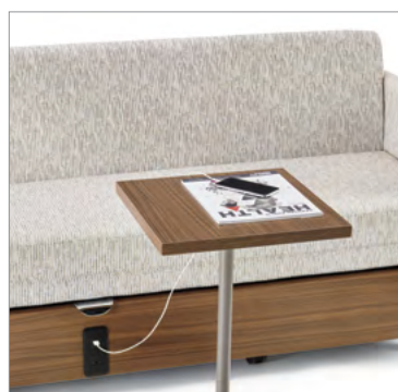
Optional power and USB outlet available on front pull-out panel