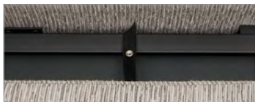
Seat cushion is field replaceable by detaching connection straps