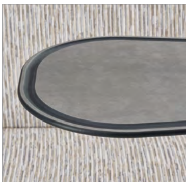
Oblong shaped, phenolic, no spill tablet is strong, non-porous and extremely durable