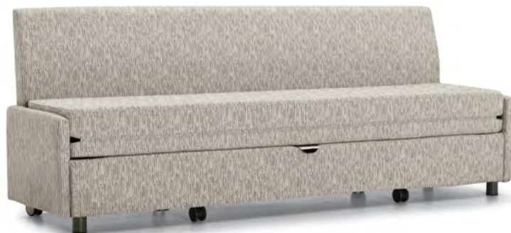
Dreme sleeper armless sofa with upholstered back and pull-out front panel.