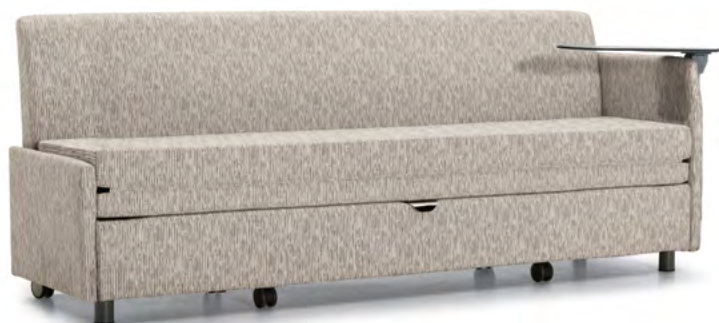
Dreme sleeper sofa with upholstered back, single left arm and tablet (single arm without tablet also available). Flip and rotate tablet is optional on sofas with arms. Upholstered pull-out front panel shown.