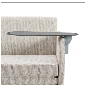
Flip and rotate tablet arm offers convenient surface for users