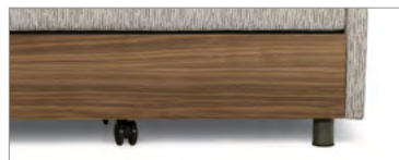
The pull-out front panel is available upholstered or in laminate