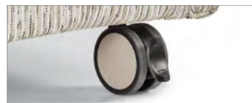
Optional locking front casters provide greater mobility