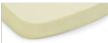
High density Ultracell foam seat for enhanced comfort