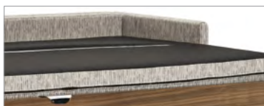
Interior area of the sleep surface cushion is finished in a moisture barrier, coated textile to support infection control practices