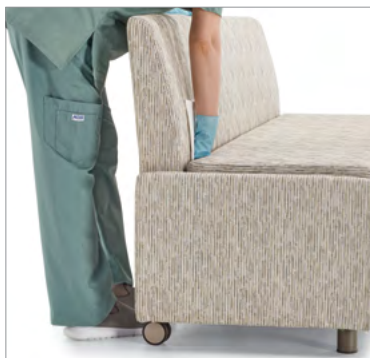
Clean out space supports housekeeping and infection control practices