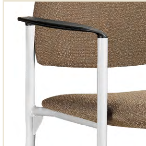
An optional Tungsten (TUN) frame finish is available, black armcap is standard.