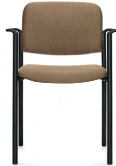
2183 Reinforced Armchair shown in Crescent Oatmeal (703) with standard Black (BK) frame finish. Squared back.