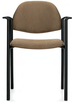
2171 Stacking Armchair shown in Crescent Oatmeal (703) with standard Black (BK) frame finish. Rounded back.