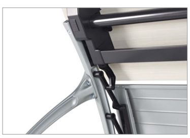
Bumpers on legs and undercarriage provide protection while nested.