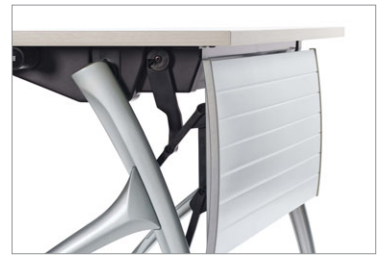
Optional articulating modesty panel.