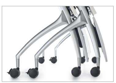
Offset "Y" leg allows for in line space saving when nested.