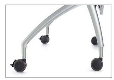
Adjustable leveling casters and two locking casters on back legs are standard.