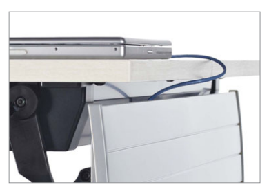
Wire management with integrated trough underneath table.