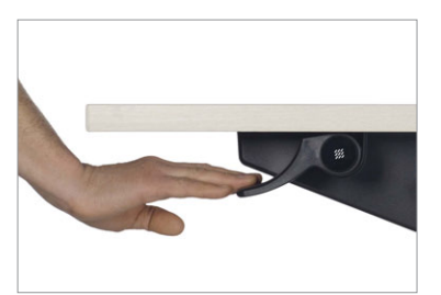
Intuitive 'Easy Touch' lever located at either table end releases mechanism for effortless movement of table surface. Fixed table top models also available.