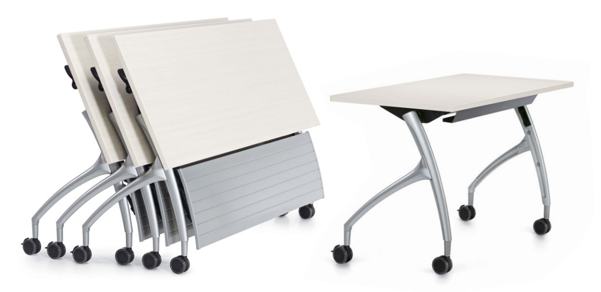
Nested flip top table with optional modesty panel shown with 60" top. Fixed top table shown with 48" top.